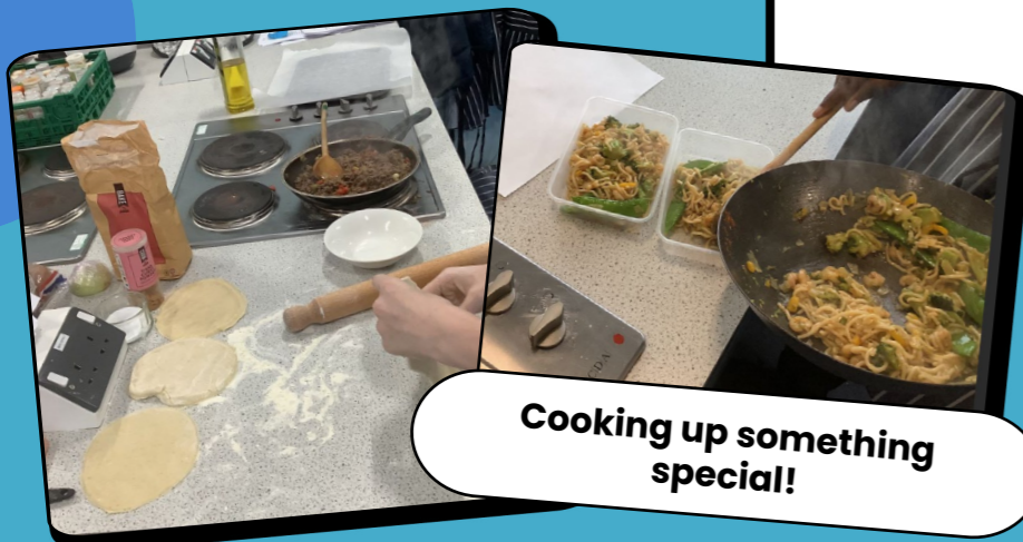
Cooking up something special!

Students have been turning up the heat in the kitchen as they work towards their Food Tech GCSE! Our young chefs never fail to impress with their delicious and well-balanced meals. They've learned all about nutrition, food safety, and the science behind great cooking - all whilst developing their creativity and teamwork skills. Whether they are cooking for themselves, their families, or customers in a gourmet restaurant, these are vital skills that will stay with them for life!