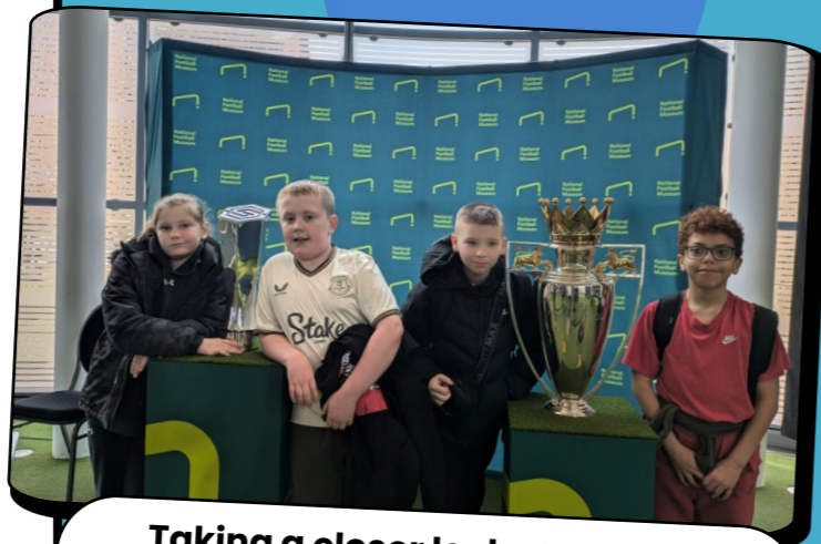
Taking a closer look at some of football's most iconic trophies.

Pupils learned all about the historic trailblazers and contemporary players who have helped to shape the beautiful game. Learning how these players overcame challenges and achieved greatness provides our pupils with a powerful source of inspiration, motivating them to pursue their goals both on and off the pitch. Another highlight was the Play Gallery, where we got the chance to take part in interactive games, exploring all the different elements of playing football and its impact on popular culture. A fantastic day reminding us of the power of sport to transform people and communities!