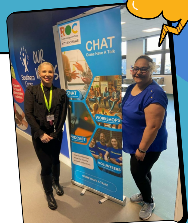
A space to talk, listen, and support!

We're proud to champion wellbeing for all members of our school community, creating an environment where everyone feels safe, supported and valued. This term, we were delighted to host Chat Space, a dedicated wellbeing hub for staff to reflect and refresh. The service brings together local health, social care, and community partners, fostering a collaborative and compassionate approach to mental health. This is a great opportunity to raise awareness and promote a culture of care, ensuring that wellbeing remains at the heart of everything we do.